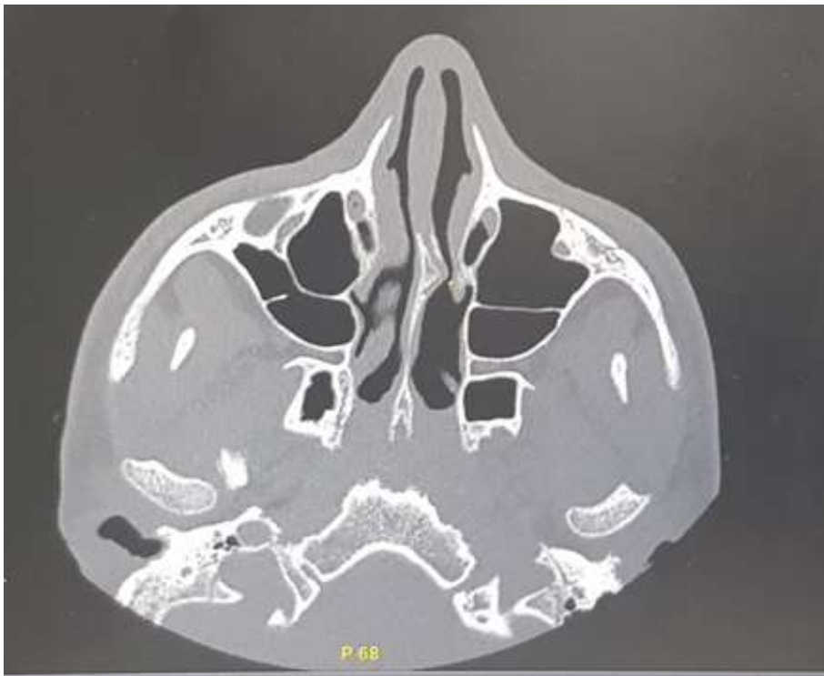
Figure 2: a non-obstructive nasal septum deviation with anatomical variations