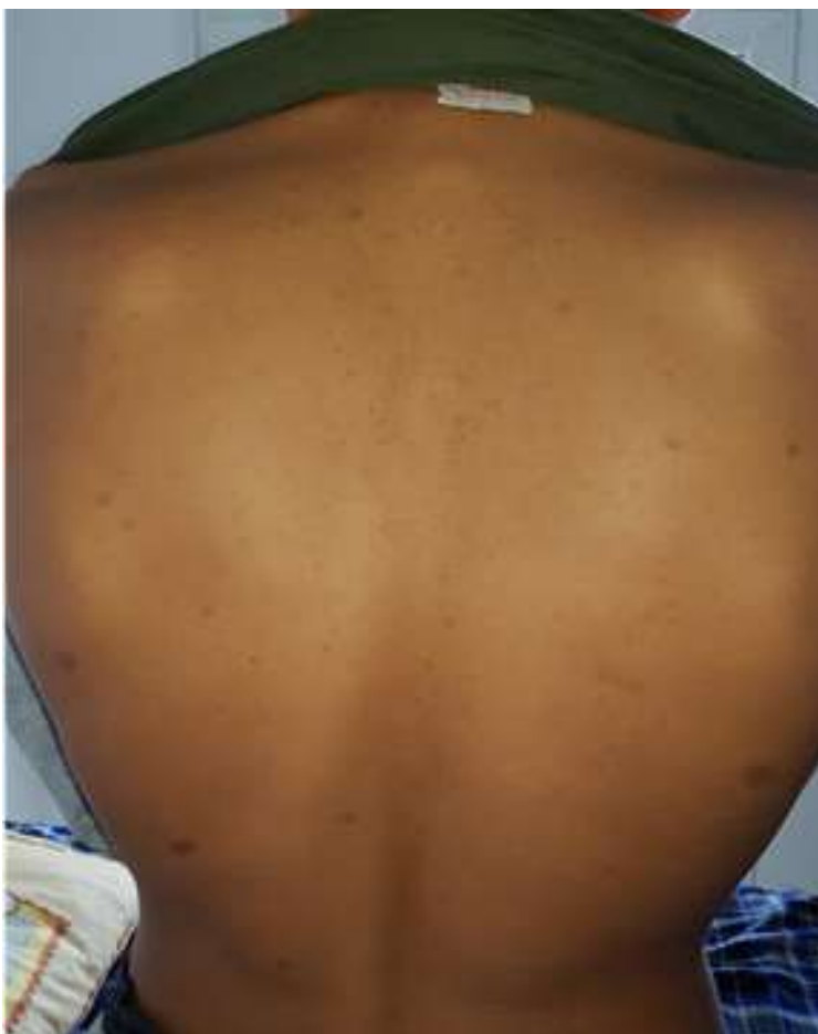
Figure 1: «café-au-lait» macules on the back