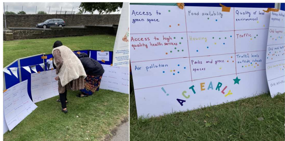
Figure 3. Community consultation in Bradford.

The final part of the consensus process was undertaken after the second survey had been analyzed (and the number of outcomes was hence reduced) with community members, that is, local families with children (Figure 3). In consensus methods, consultation with patients, or community members, is recommended when there is no clear consensus among the experts and it can ensure that outcomes are included that are important to community members [2]. The community member consultation was conducted using ‘dot voting’ and by utilizing principles of the nominal group technique, which facilitates quick, structured decision making [16–18]. In dot voting, participants are given colored dot stickers that they can use to indicate their votes in priority setting and consensus exercises. In addition to the ‘dot voting,’ we facilitated a play activity that children could engage in, whilst adults were asked to contribute to the core outcome consultation.