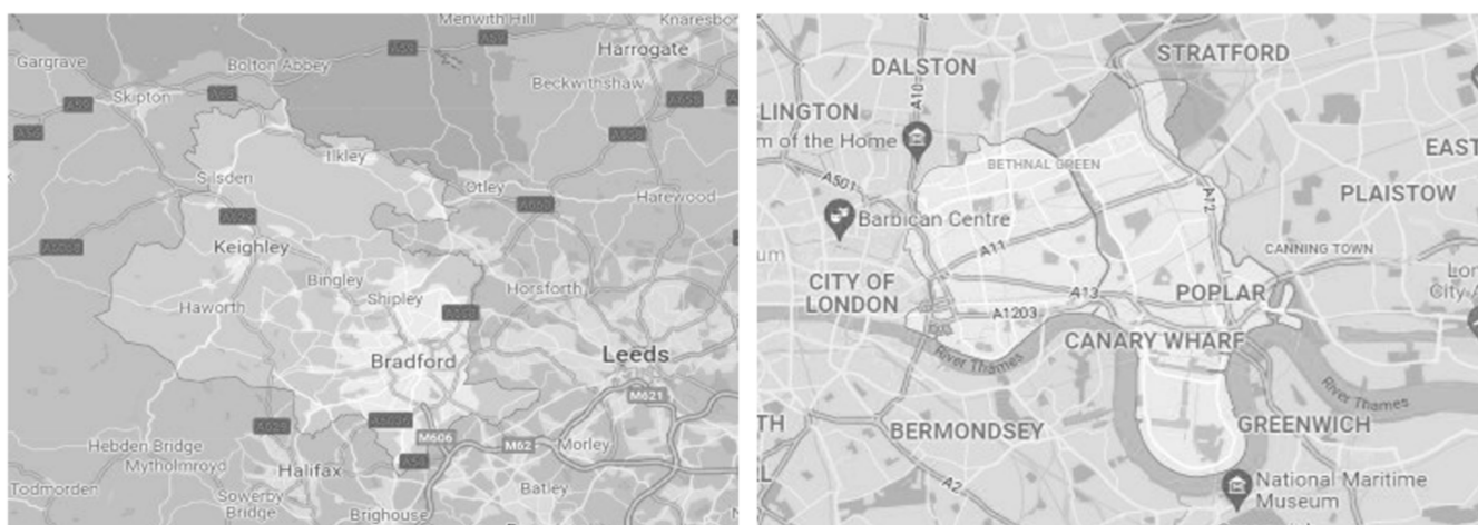
Figure 1. Maps of ActEarly study areas: Bradford Metropolitan District (left) and the London Borough of Tower Hamlets (right).

The populations that are the targets for the application of the COS-EY in the first instance were children and families living within the ActEarly study areas: Bradford Metropolitan Area in West Yorkshire and the Borough of Tower Hamlets in London (Figure 1).