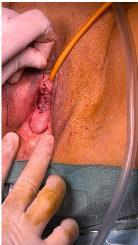
Fig. 3. Surgical excision of the lesion.