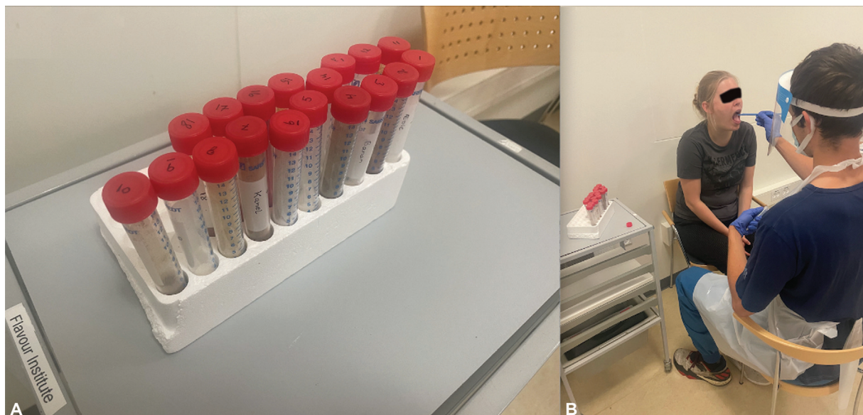
Fig. 3 (A) A picture of the test. 3B: A picture of a participant taking the test.

centrally mediated through unconscious memory recall and not intact retronasal olfactory function. For correct diagnostics in situations like this, retronasal olfactory testing is essential.