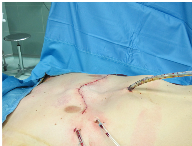
Fig. 3. Final closure after pectoralis muscle mobilization.

serum exiting from the surgical wound. A clinical examination showed that the hardware was exposed. Microbiological samples from the wound were negative, and the patient was afebrile, with no general symptoms. Therapy with a broad-spectrum antibiotic was introduced. In accordance with the plastic surgeon, the patient underwent surgical debridement multiple times (three times) to prevent infection of the bone (Fig. 1D–H). VAC therapy was performed every time after debridement. The patient was then referred to the Plastic Surgery Unit. The final closure of the wound was performed 10 days after the last debridement.