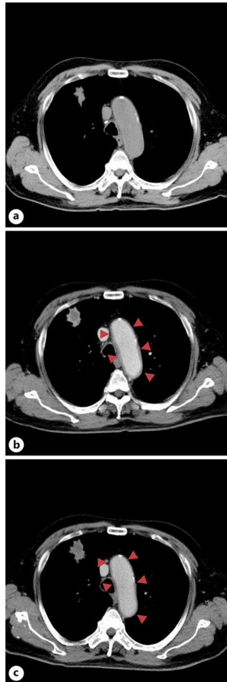
Fig. 1. Computed tomography (CT) images. a A chest plane CT image taken on the 17th day after PEG-G-CSF administration. This image does not show an increased soft periaortic shadow. b A chest contrast-enhanced (CE)-CT scan obtained on the 18th day of PEG-G-CSF administration. This image shows an increased soft periaortic shadow suggestive of aortitis. c The chest CE-CT scan performed on the 33rd day of PEG-G-CSF administration. As indicated by the red triangle in the figures, the periaortic soft shadow shrunk compared with that shown in b .

resolution since admission, and had been treated with ICIs. Therefore, he was followed up carefully with antipyretic analgesics alone without systemic corticosteroid treatment. On the 20th day, the patient's body temperature improved to 36°C, right ear pain and inflammatory response gradually improved, and contrast CT on the 33rd day showed improvement in periaortic inflammatory findings (Fig. 1c, 2). Serum IL-6 level diminished to 8.7 pg/mL at that time. As the possibility of immune-related adverse events remained, carboplatin/etoposide was reduced to an 80% dose, and Dur was discontinued during the second course of chemotherapy. The patient's condition progressed uneventfully, except