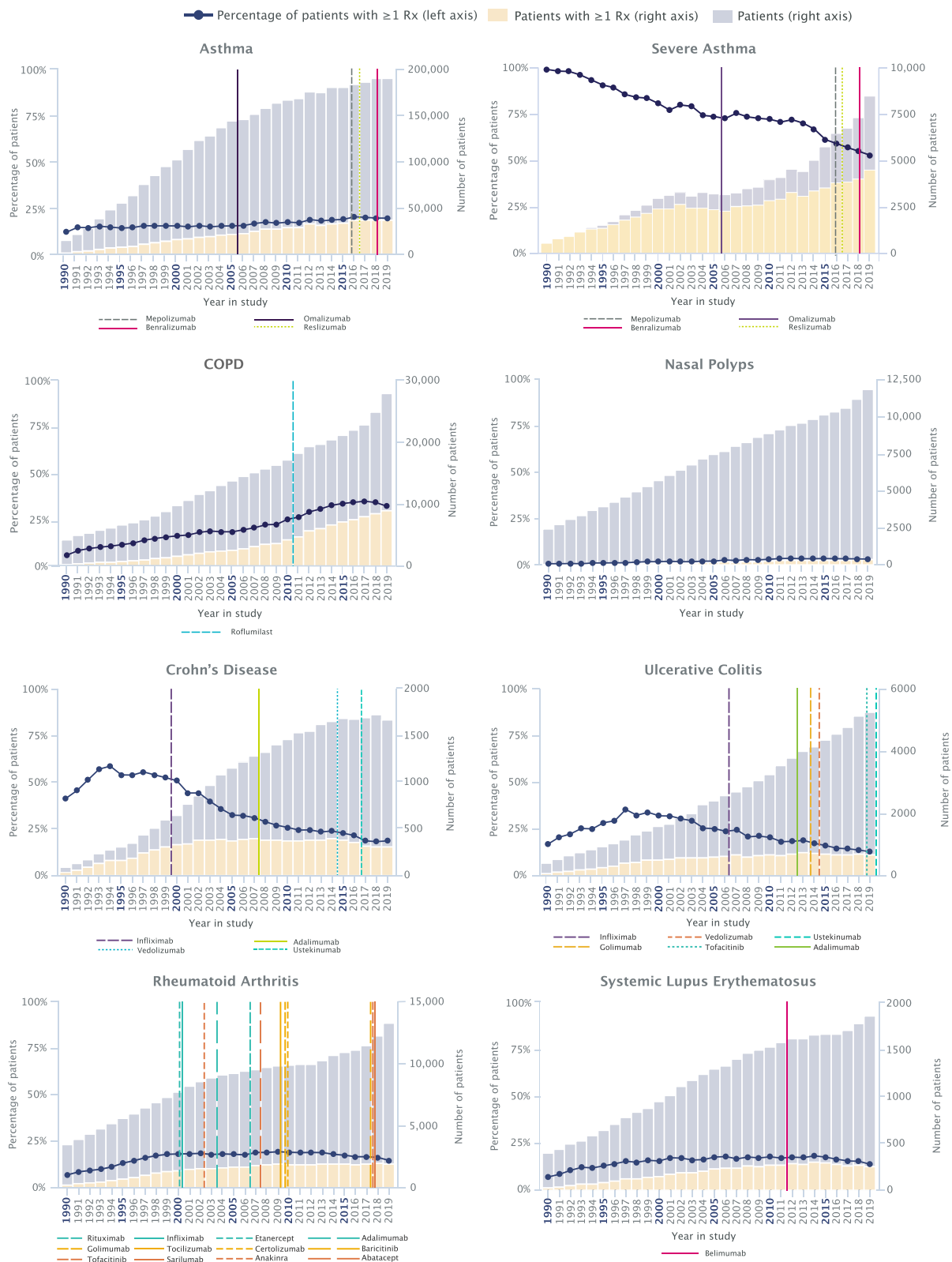
Figure 2 Patients with one or more prescriptions of SGCs. Number and percentage of SGC prescriptions per patient per analysis year for asthma, severe asthma, COPD, nasal polyps, Crohn's disease, ulcerative colitis, rheumatoid arthritis, and systemic lupus erythematosus. European Medicines Agency approval dates for biologic therapies are marked by vertical lines. In order to minimize misattribution of an SGC indication, only one condition per patient per year for which an SGC could have been prescribed was used for these analyses.

Abbreviations: COPD, chronic obstructive pulmonary disease; SGC, systemic glucocorticoid.