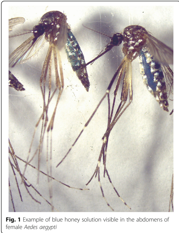
Fig. 1 Example of blue honey solution visible in the abdomens of female Aedes aegypti

easily spotted for counting. An overturned black plastic bucket from a Gravid Aedes Trap (GAT) [16] was placed at the middle of each tent to attract and induce swarming by male mosquitoes and provide a resting site for females. A small dish with the lure-treated sponges was placed on top of each GAT bottom. This feature was added after preliminary trials showed very little interaction with the sponge in the absence of a swarm marker or resting site.