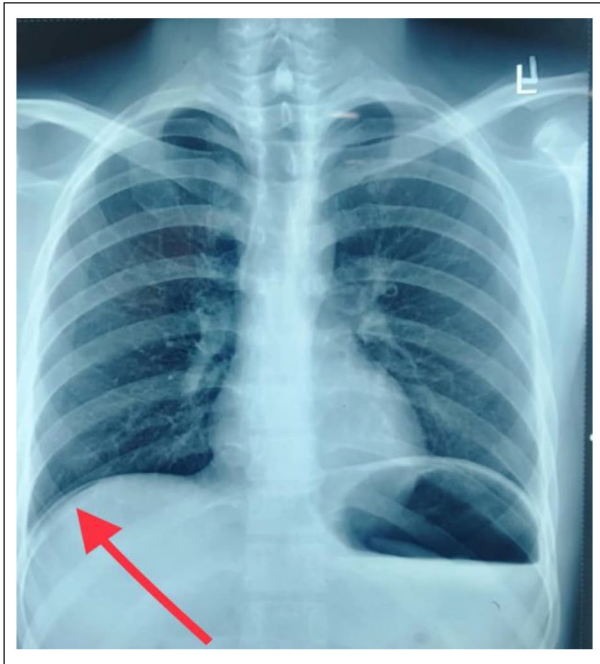
Figure 1. Erect chest X ray showing air under right hemidiaphragm (red arrow) in a 23-year-old man with the history of jumping from the door of Indian jumbo truck.