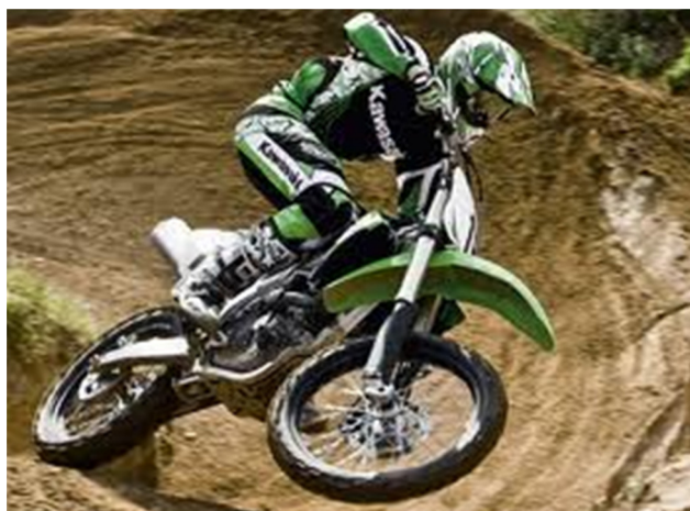
Fig. 1 – Motocross biomechanics, jumps and curves.

We report a case of stress fracture of the acetabular roof due to motocross practice.