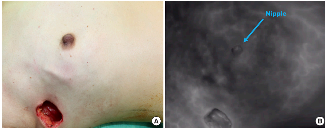
Fig. 1. Intraoperative photography grossly showing good perfusion of the preserved skin flap and the nipple in a nipple-sparing mastectomy before implant reconstruction (A), which was further confirmed by intravenous indocyanine green injection and visualized using a SPY machine (B).

breast on the anterior axillary line. A mammary sizer was first inserted to ensure adequate pocket creation and to select the implant size. After that, the pocket was irrigated with a large amount of saline, and secure hemostasis was achieved. A suction drain was inserted. Before finalizing the surgery, two stitches to anchor the inferior margin of the PM muscle to the spared skin flap were placed using Vicryl sutures to prevent muscle retraction without coverage of the implant. This helped ensure that the PM muscle would stay in the planned position and prevent the implant from sliding into the prepectoral space before complete capsule formation. The breast implant was then placed. Before wound closure, to provide better control of the lateral pocket for the breast implant, two stitches were placed to anchor the dermis of the anterior axillary line to the corresponding underlying periosteum. The stitches helped prevent lateral displacement of the implants. After wound healing, the lateral border of the reconstructed breast would then be formed. The wound was closed primarily. Patients received parenteral prophylactic antibiotics postoperatively for 3 days before being discharged.