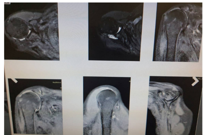
Fig. 3. Magnetic resonance imaging revealed substantial atrophy at all of the middle deltoid and most of the posterior deltoid region of the right shoulder. The anterior fibers of the deltoid were found to be intact. The subscapularis and supraspinatus tendons were retracted up to the medial area of the glenoid. Stage 3–4 fatty infiltration was detected in the subscapularis and supraspinatus according to the Goutallier classification.