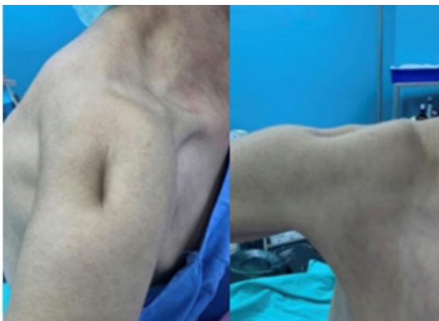
Fig. 1. The atrophied deltoid muscle was seen upon visual shoulder inspection.

During the follow-up period in the rheumatology department in 2016, the patient reported pain and weakness in her right shoulder and consulted our department. Notably, she had not undergone any previous shoulder surgery. She was examined by a senior shoulder-and-elbow surgeon. Upon examination, she had an atrophied deltoid muscle, a painful right shoulder on movement, and a tender mass in the deltoid area (Fig. 1). A shoulder range of motion examination revealed active forward flexion of 70°, abduction of 50°, internal rotation to the sacrum, and external rotation of 10°. The American Shoulder and Elbow Surgeons (ASES) score was 21.6 of 100, and the Constant score was 25 of 100 at preoperative evaluation. Neurological examination showed normal findings, except for slightly weak abduction and flexion in the right shoulder. The blood test results were as follows: erythrocyte sedimentation rate, 35 mm/hr; C-reactive protein, 17 mg/L; and white blood cell count, 12,100/ \mu L. For a thorough evaluation, radiography and magnetic resonance imaging (MRI) were performed. The MRI revealed substantial atro-