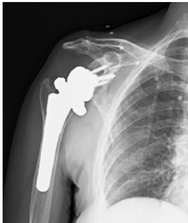
Fig. 5. Postoperative anteroposterior shoulder radiographs of the patient.