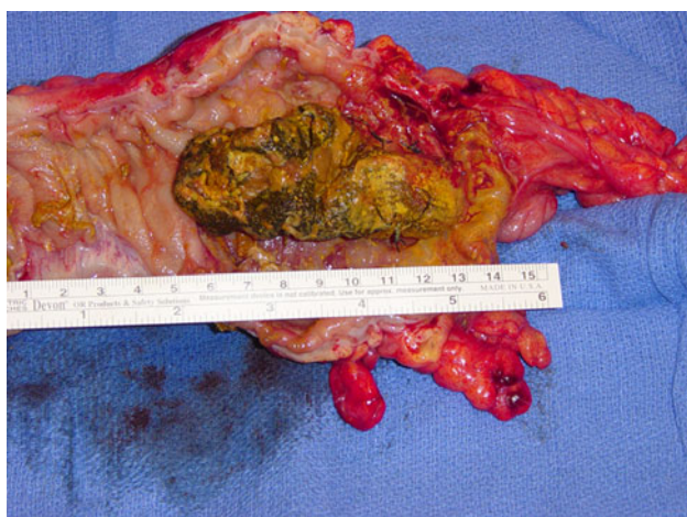
Fig. 2 Opened sigmoid colon with intraluminal mesh

and AlloDerm. The skin was only loosely approximated with staples.