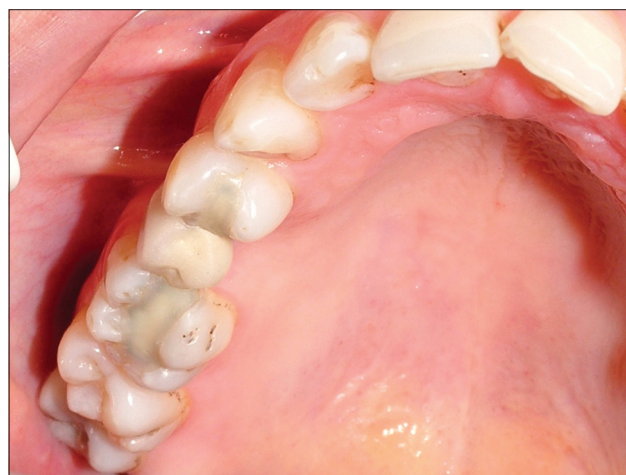
Figure 1: Occlusal view of cast metal-inlay slot cavity-retained resin-bonded fixed dental prostheses for a single missing maxillary right second premolar in situ