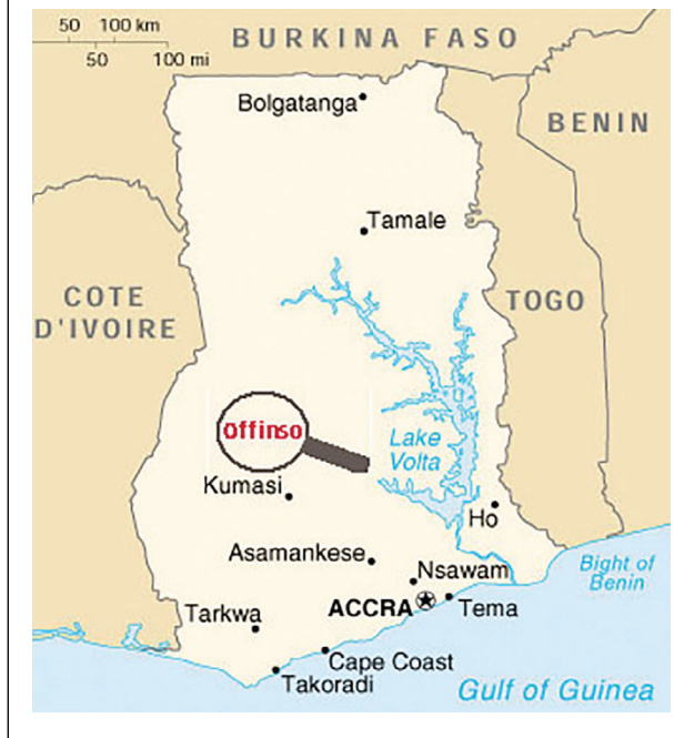
Fig. 2 Location of St Patrick Hospital, Offinso, Ghana

This study was approved by the St Patrick Hospital administration and Tamale Teaching Hospital ethical review committee (reference THERC/17/11/16/09). Patients were consented before surgery for participation in the study, including additional clinical follow-up. The use of mesh repair for inguinal hernia has approval from the Ghana Health Service and the Ministry of Health, Ghana.