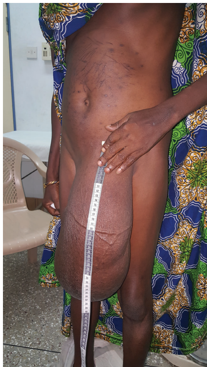
Fig. 1 Large inguinoscrotal hernia

In collaboration with the Ghana Health Service, the Ghana Hernia Society has prioritized increasing the availability of mesh inguinal hernia repair. This study aimed to determine the safety and efficacy of a change in practice from suture to mesh repair in a small district hospital in Ghana.