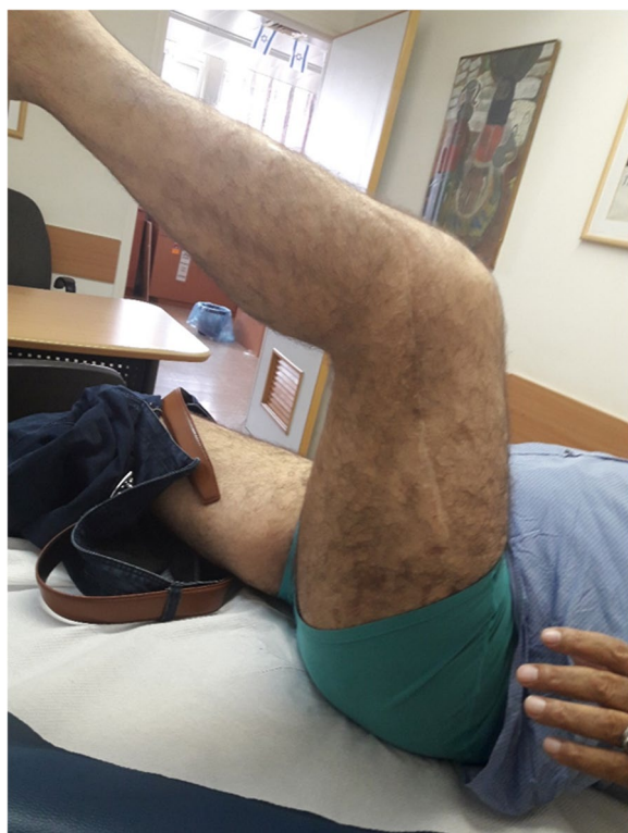
Fig. 3 Eleven-year follow-up – no signs of infection; cemented rod and beads not removed

The various biocompatible and bioabsorbable technologies are especially useful, if a planned secondary procedure for re-instrumentation, bone grafting, or soft-tissue reconstruction are not required. However, the biodegradable products have their drawbacks: (1) Not strong enough as load-bearing spacers; (2) Intrinsic chemical intolerances preventing the product(s) from hardening limiting the amount of mixing up antibiotics. (3) Inflammatory byproducts released during their degradation creating eventually wound seromas in as many as 20–28% of cases [22].