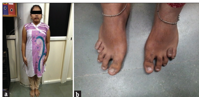
Figure 1: (a) Turner syndrome patient with short stature, (b) Turner syndrome patient having overlapping fourth toe in left and short fourth toe in both foot

Most of the females with a ring chromosome X that is r(X) have an appearance of somatic signs of TS, including short stature, peripheral oedema, characteristic