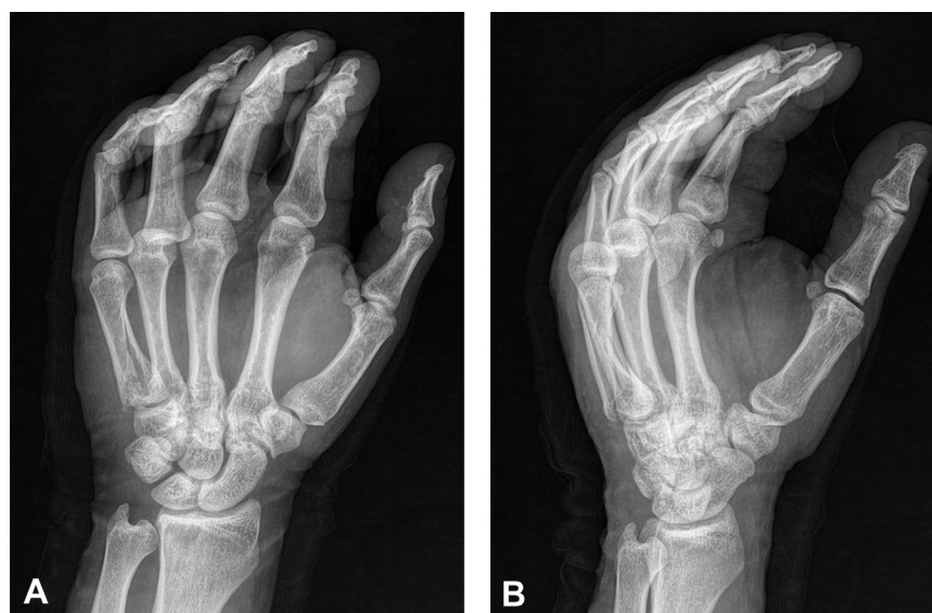
Figure 1. A Anteroposterior x-ray of the patient's left hand at presentation. Notice the dislocation of the fourth MCP, as indicated by the overlapping metacarpal head over the base of the proximal phalanx and by the oblique fracture of the fifth metacarpal. B Oblique x-ray at presentation. Notice the dislocation of the base of the proximal phalanx of the ring finger and the oblique fracture of the fifth metacarpal.

* Uncited references are provided in Appendix 1 (available on the Journal's website at www.jhsgo.org ).