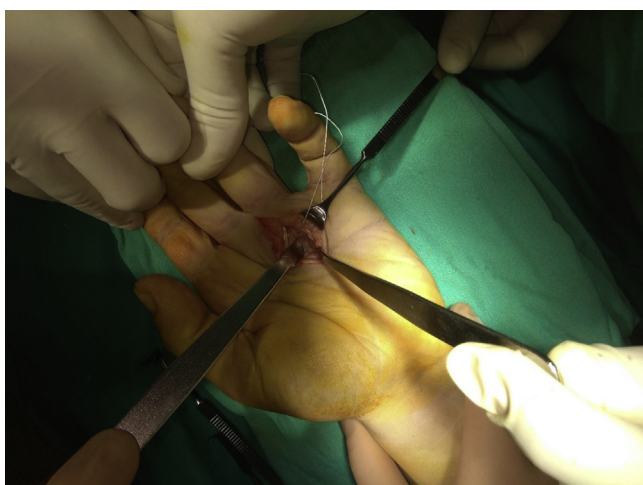
Figure 3. Intraoperative view showing the palmar approach.

volar plate. It was torn distally and loose proximally. We stabilized it using 2-mm suture mini anchors. First, 2 anchors were inserted at the base of the proximal phalanx. The proximal insertion continued to be loose; thus, additional 2 anchors were inserted at the neck of the metacarpal (Fig. 3). Dorsally, we inspected the joint, cleared the fibrous tissues, and centralized the ulnarly dislocated extensor. We raised a strip from the radial side of the extensor tendon, preserving its distal continuity with the tendon, passed it as a loop underneath the tendon, and sutured it to the radial deep transverse ligament. Before closing the wound and after suturing the joint capsule, reinforcing the sagittal band and the extensor hood with duplicating 4-0 nylon sutures, we assessed the joint stability by passive flexion and extension of the wrist and the joint. To secure our reduction, we used an external fixator with 3 mm of joint distraction (Fig. 4). To avoid tension at the repaired dorsal structures, especially the radial sagittal band repair, the joint was stabilized at 45° rather than at 70°. Feeling confident about the joint stability, we chose a shorter immobilization period. Three weeks later, we removed the external fixator and started gentle active flexion and extension as tolerated. At 8 weeks, the patient achieved 90° flexion and -30° extension. Six months after surgery, his motion was unchanged. We noticed a deviation of the finger during extension,