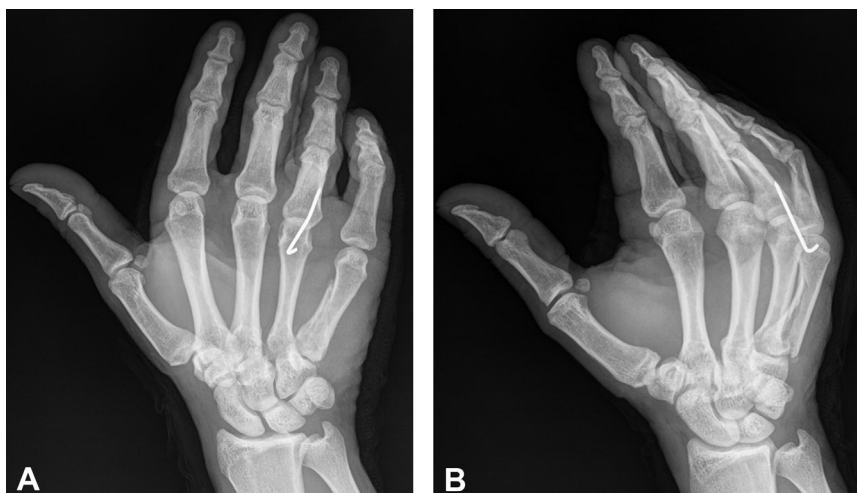
Figure 2. A Anteroposterior view of the patient's left hand after the first reduction with a dorsal approach. B Oblique views of the patient's left hand after the first reduction with a dorsal approach and stabilization with Kirschner wire in 70° flexion.