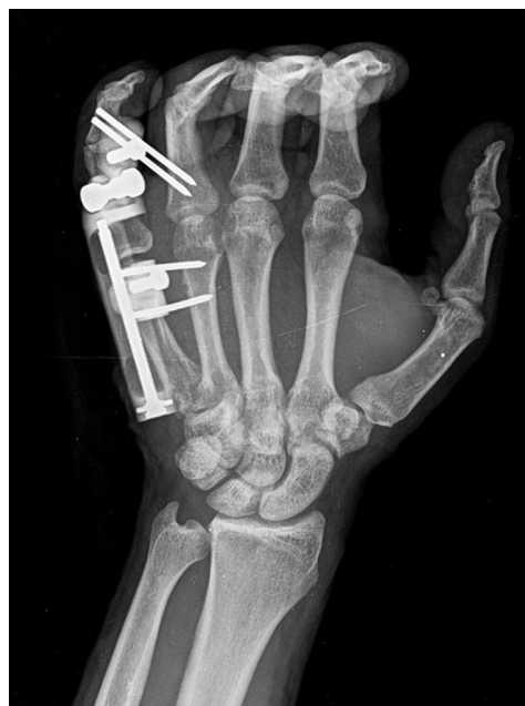
Figure 4. Stabilization of the MCP joint with external fixator after combined dorsal and palmar approach.

volar plate. It was torn distally and loose proximally. We stabilized it using 2-mm suture mini anchors. First, 2 anchors were inserted at the base of the proximal phalanx. The proximal insertion continued to be loose; thus, additional 2 anchors were inserted at the neck of the metacarpal (Fig. 3). Dorsally, we inspected the joint, cleared the fibrous tissues, and centralized the ulnarly dislocated extensor. We raised a strip from the radial side of the extensor tendon, preserving its distal continuity with the tendon, passed it as a loop underneath the tendon, and sutured it to the radial deep transverse ligament. Before closing the wound and after suturing the joint capsule, reinforcing the sagittal band and the extensor hood with duplicating 4-0 nylon sutures, we assessed the joint stability by passive flexion and extension of the wrist and the joint. To secure our reduction, we used an external fixator with 3 mm of joint distraction (Fig. 4). To avoid tension at the repaired dorsal structures, especially the radial sagittal band repair, the joint was stabilized at 45° rather than at 70°. Feeling confident about the joint stability, we chose a shorter immobilization period. Three weeks later, we removed the external fixator and started gentle active flexion and extension as tolerated. At 8 weeks, the patient achieved 90° flexion and -30° extension. Six months after surgery, his motion was unchanged. We noticed a deviation of the finger during extension,