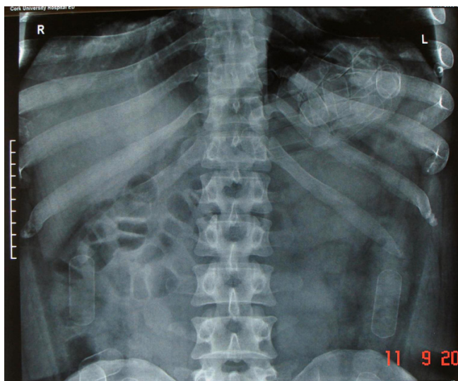
Figure 1 Plain radiograph of the abdomen demonstrated multiple homogenous radiopacities within the lumen of the bowel demonstrating the typical appearances of Type IV packages.

When surgical extraction is necessary the focus must be on removing all packets. One surgical review of the topic recommends that a single enterotomy is usually sufficient to do this as the packages can usually be "milked" to the enterotomy site and evacuated manually [3]. The tough exterior coat on type VI packages facilitates their milking along the gastrointestinal tract without the risk of rupture seen with types I, II and III. Other reports however warn that wide dispersion of packets in the gut may make intra-operative detection difficult and suggests that multiple