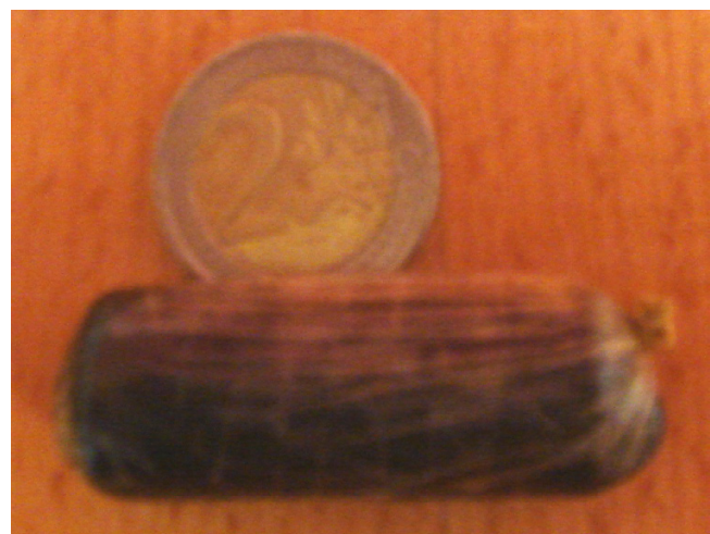
Figure 2 Photograph demonstrating thick wall of a capsule with white substance (found subsequently to be cocaine paste) within.