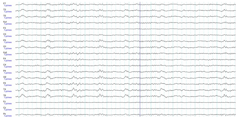
FIGURE 2: EEG acquired at time of presentation due to multiple seizures reported by patient's wife and R posterior temporal dominant periodic lateralized discharges, and otherwise normal activity.