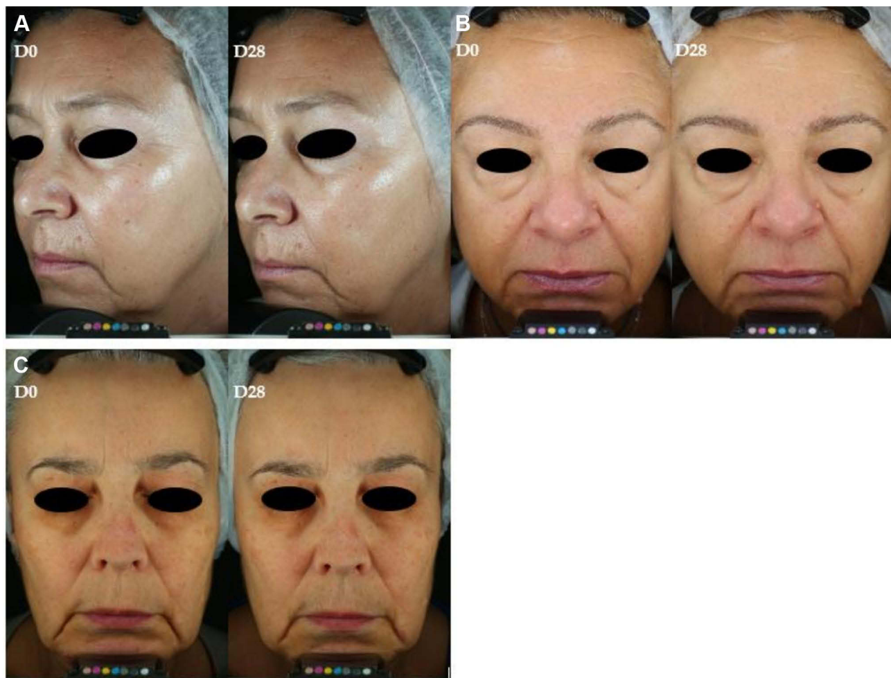
Figure 3 (A) Periocular wrinkles (standard general white lighting). (B) Bags under the eye volume results (standard general white lighting). (C) Dark circles color (cross-polarized filter).

instrumentally measured datum was scored as a “mild improvement” by the dermatologist in most of the subjects (70%) participating in the study (Figure 3A).