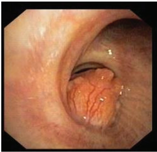
Figure 3 Fiberoptic bronchoscopy revealed a well-circumscribed polypoid endobronchial lesion that almost completely obstructed the lumen of the intermediate bronchus.

Computed tomography and magnetic resonance imaging (MRI) are reported to be helpful in establishing the diagnosis by demonstrating a fatty tumor within the bronchial lumen. CT is highly specific and sensitive for the detection of fat, and the presence of fat within a lesion suggests a benign etiology, such as lipoma or hamartoma. 8,9 Several reports of MRI appearance of lipoma have shown high signal intensity on T1-weighted images and intermediate signal density on proton density and T2-weighted images, compatible with normal fat. 10 Although fiberoptic bronchoscopy is the most valuable method of diagnosis of endobronchial lesions, it is not usually sufficient to make diagnosis of endobronchial lipomas, as in our case. Thus, surgical or bronchoscopic resection must be performed in order to reach final diagnosis. Although endobronchial removal with laser therapy is the preferred treatment option, 9 the patient underwent right thoracotomy and bronchiotomy since we had technical difficulties related to interventional bronchoscopy.