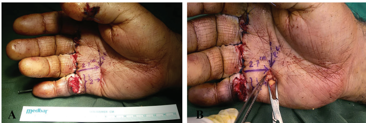
Fig. 3: A: A 37-year-old man has multiple injuries in Zone 2 due to cuts while working with a saw machine. B: After exploration of his deep flexor tendon.