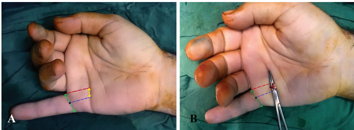
Fig. 2: A: The 22-year-old man suffered the deep flexor tendon rupture after repairing of the finger injury in another center. Blue dash line: The mid-axial lines, red line: the ulnar border distance of little finger, green arrow: the foot print and the yellow arrow: The location of proximal flexor tendons. B: The second patient after detection of the deep flexor tendon.