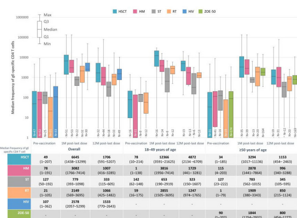
RZV, adjuvanted recombinant zoster vaccine; ATP, according-to-protocol; gE, glycoprotein E; M, month; Q1, Q3, first and third quartiles; N, number of participants with available results; HSCT, autologous hematopoietic stem cell transplant recipients; HM, hematologic malignancies patients; ST, solid tumor patients; RT, renal transplant recipients; HIV, human immunodeficiency virus-infected adults; ZOE-50, adults ≥50 years of age from the pivotal efficacy trial in older adults. Adapted ATP cohort for cell-mediated immunogenicity includes ATP cohort with cell-mediated immunogenicity data for each timepoint (pre-vaccination, 1M post-last dose, 12M post-last dose). HIV-infected adults were not divided by age group and immunogenicity analyses were only done overall. The green bars display the cell-mediated immune responses in adults ≥50 years of age from the pivotal efficacy trial (ZOE-50, Cunningham et al., 2018), which are provided here for reference. Note: In the HSCT study (NCT01852003), cell-mediated immune responses were also measured at 23M post-RZV dose 2 and found to continue to persist well above pre-vaccination levels.

Figure 2. Cell-mediated immune responses to RZV in immunocompromised populations (adapted ATP cohort for cell-mediated immunogenicity)