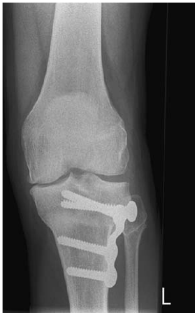
Fig. 2 An example of the closed wedge high tibial osteotomy (CWO)

A standard anterolateral approach was used. An osteotomy and resection was performed through the fibular head. Two centimetres below and parallel to the joint line a Kirschner wire was inserted to aim the osteotomy. First, the proximal cut was performed and the medial cortex was preserved. Using an aiming device the distal cut was made and the bone wedge was removed. The aiming device we used consists of a blade which is put in the first saw cut. The second cut is performed through a cleft in the device with an adjustable angle to the blade. The defect was closed and the osteotomy was fixed with a four-hole locked plate (Numélock II system, Stryker, Switzerland).