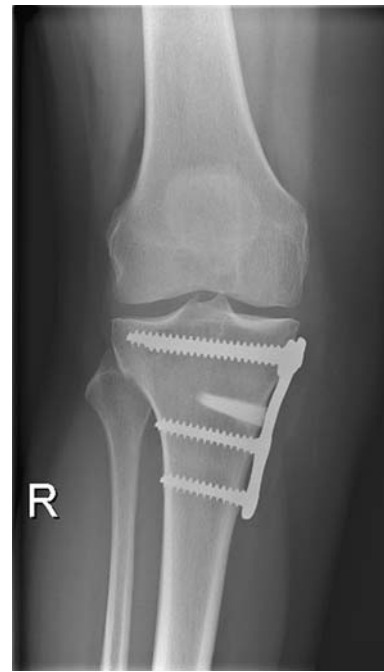
Fig. 3 An example of the open wedge high tibial osteotomy (OWO)