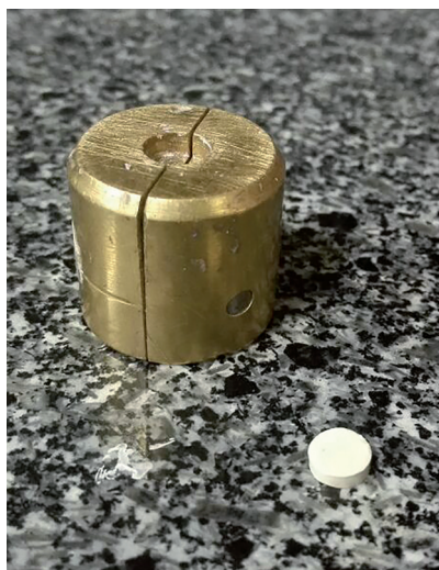
Fig. 1. Split mold and specimen.

The use of glass ionomers as a restorative material is still questionable in many clinical areas. Reinforcements such as resin modification or metal-reinforcements have not still been satisfactory in clinical practice, especially in load-bearing areas (15). The effect of adding 10 and 30% wt of bioactive glasses (BAG) was evaluated on RMGI and CGI and it was reported that the compressive strength of the specimens decreased with an increase in the amount of BAG (7).