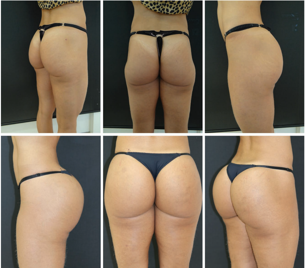
Fig. 5. 2009 (A) and 2019 (B). Maintenance of the volumetry and improvement in the quality of the skin with lifting effect even with aging.