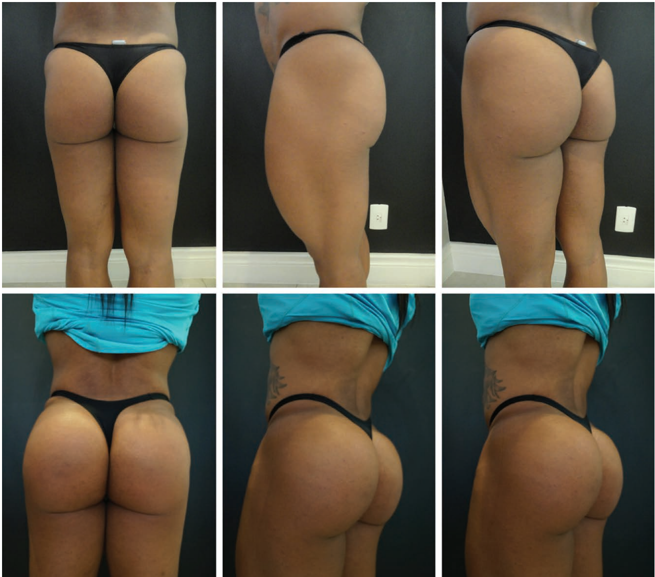
Fig. 1. Evolution of PMMA from 1990s to 2000s (from first to third generation). A and B, PMMA of the first generation: spheres of small and irregular size that contribute to the formation of granuloma. C and D, PMMA of the third generation: regular spheres with 40 \mu\text{m} diameter.

(due to vascular obstruction) has been observed, since a blunt-tipped atraumatic microcannula is not able to injure blood vessels. Thus, cases that recorded these occurrences are anecdotal and confirm clandestine products on the market. Industrial liquid silicone is the main cause of all the confusion, being responsible for migration, lymphedema, and silicosis. 23