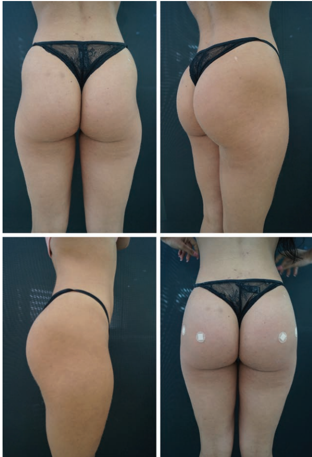
Fig. 3. PMMA gluteal filling.

The PMMA in Brazil has regular particles of 40 µm solid diameter and smooth surface. The vehicle and other products already marketed with other raw materials already