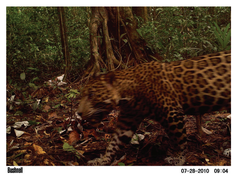
Figure 2. A jaguar near the community of Punta Aguila (the indigenous name is Bankukuk Taik) captured by a camera trap installed by the Michigan State University. The location of the photograph is directly in the footprint of the canal. A jaguar was also photographed at the same location in 2014.

for many species. An artificial connection of these watersheds would have potentially detrimental consequences for several species and families (e.g., Poeciliidae, Cichlidae, and Characidae), such as the hybridization of genetically distinct, locally adapted populations or extinction by species replacement. Either scenario would lead to the loss of unique genetic diversity.