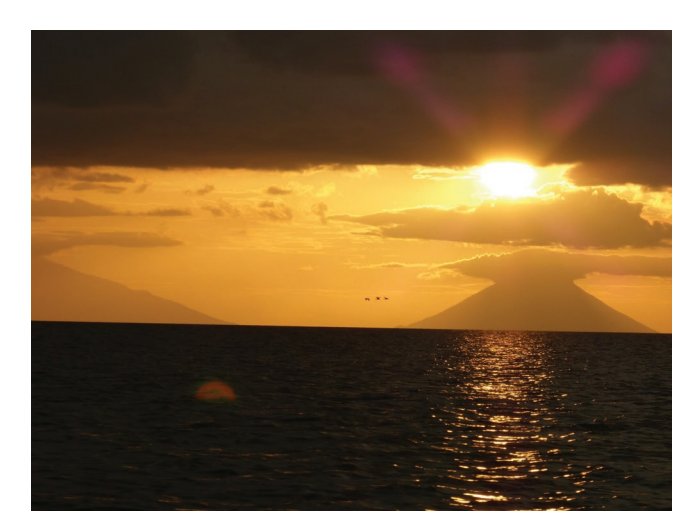
Figure 3. A view of Ometepe Island with its twin volcanoes illustrates the proximity of a major fault line to the canal route.

to 190 camera-trap days) and detected less than 50% of the known species for the region (Jordan and Urquhart 2013, Jordan 2015). The mitigation measures suggested by ERM are unlikely to be useful for rebuilding forests or preventing substantial biodiversity loss.