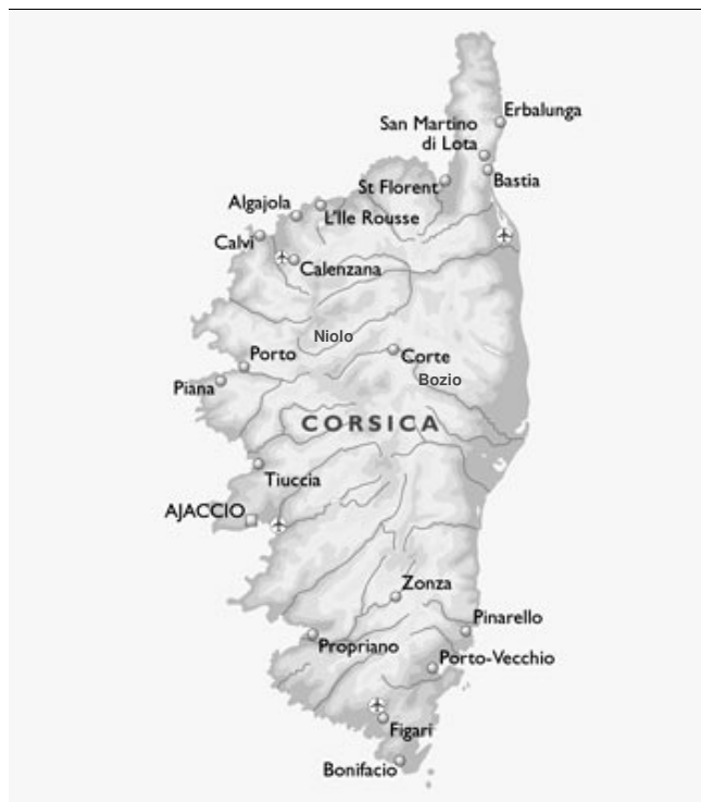
Figure 1 Corsica island.

In the present study we report the LD pattern on Xq13-21 microsatellite markers in a Corsican coastal sub-population in order to assess the presence of a decrease of LD