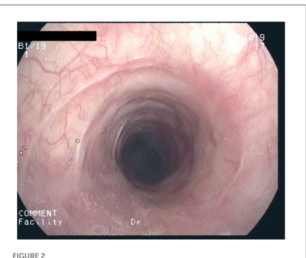
After 1 year of macrolide-therapy: Circular deformed, non-stenotic trachea with considerably diminished scar formation.

showed an increased inflammatory pattern with a normal tracheal diameter (Figure 2). AZT was increased to 3 \times 500 mg/week and pantoprazole was added for 4 weeks, again without any positive effect on coughing. AZT was exchanged for roxithromycin 300 mg every other day, because of the probable better anti-inflammatory properties with a lesser dose given. Headache and arthralgia ceased and coughing improved. Laboratory testing showed no signs of inflammation; only discrete blood eosinophilia was noted. After 5 months, roxithromycin was raised to 300 mg/d because of increased coughing. This led to marked and lasting improvement of symptoms. Since macrolide therapy was instituted 3 years ago, spirometry remains normal (Table 1).