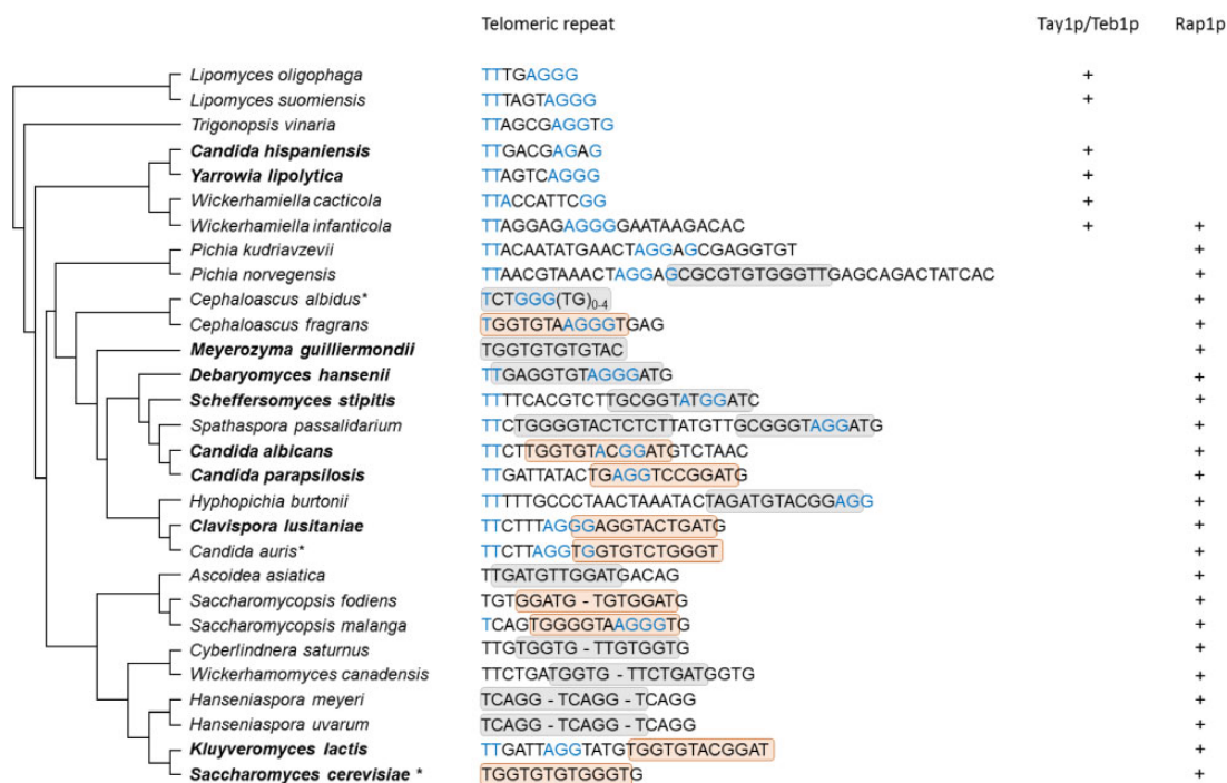
FIG. 2. —Variability of telomeric repeats and TBPs in the subphylum Saccharomycotina. Topology of the phylogenetic tree was inferred from Shen et al. (2016). Blue text represents the 5'-TTAGGG-3' sequences, orange boxes mark the conserved Rap1p-binding sites (according to Wahlin and Cohn 2000) and gray boxes mark the degenerate Rap1p-binding sites (up to 2 substitutions/indels). Tay1p and/or Rap1p homologs were identified in genomic sequences using the TBLastN algorithm (blast.ncbi.nlm.nih.gov) and the sequence of ScRap1p or Y/Tay1p as query. Putative homologs ( E -value < 1.10^{-12} ) are indicated (+). The species with confirmed telomeric repeats are listed in bold, asterisks indicate the presence of heterogenous repeats.

Importantly, Tay1p was reported to bind 5'-TTAGGG-3' repeats with higher affinity than the natural telomeric sequence of Y. lipolytica (5'-TTAGTCAGGG-3') (Višacká et al. 2012), suggesting that either 1) the optimal affinity of this protein toward telomeric sequences is not necessarily the highest possible (Tomáška et al. 2019), or 2) in its evolutionary history, Tay1p was selected as the 5'-TTAGGG-3'-binding protein and as soon as the telomeric repeats of yeasts started to accumulate mutations, its affinity toward the new motifs decreased. The second scenario relies on the presumption that telomeric repeats evolved faster than the corresponding TBPs and is consistent with the fact that besides telomeres, TBPs usually bind various DNA sequences located inside the chromosome (such as promoter regions of specific genes) and interact with different protein partners (e.g., transcription activators). As a result, yeast TBPs had to adapt to new telomeric repeats while maintaining the already existing interactions. Understandably, a combination of both aforementioned scenarios is possible, assuming a wider range of affinities between telomeric repeats and the TBP is acceptable for the TBP (in this case Tay1p) to fulfill its telomeric functions. Nevertheless, in many yeast lineages with further modified telomeric repeats, TAY1 gene was not identified in the genome (these species recruited Rap1p as TBP; fig. 2), suggesting the gradual decrease in affinity of the ancestral TBP