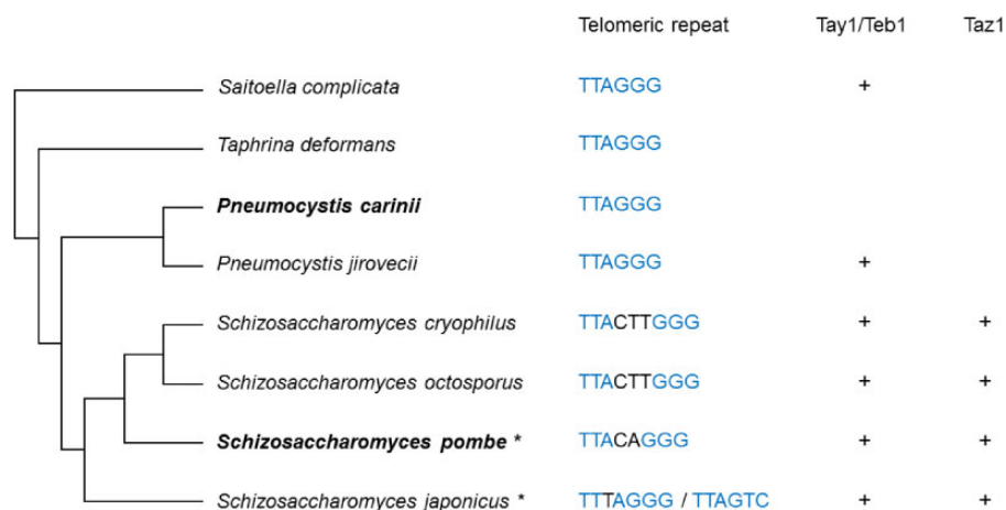
Fig. 4. —Telomeric repeats and TBPs in the subphylum Taphrinomycotina. Topology of the phylogenetic tree was inferred from Milo et al. (2019). Blue text represents the 5'-TTAGGG-3' sequences. Teb1p and/or Taz1p homologs were identified in genomic sequences using the TblastN algorithm (blast.ncbi.nlm.nih.gov) and the sequence of SpTeb1p or SpTaz1p as query. Putative homologs ( E -value < 1.10^{-5} ) are indicated (+). The species with confirmed telomeric repeats are listed in bold, asterisks indicate the presence of heterogenous repeats.

telomerases were tolerated. The heterogeneity itself might have been introduced later by different types of error-prone telomerase complexes, establishing a dynamic balance between the properties of specific TBP and corresponding telomerase. According to this hypothesis, the emergence of telomeric heterogeneity might be expected in more yeast species with flexible TBPs in the future.