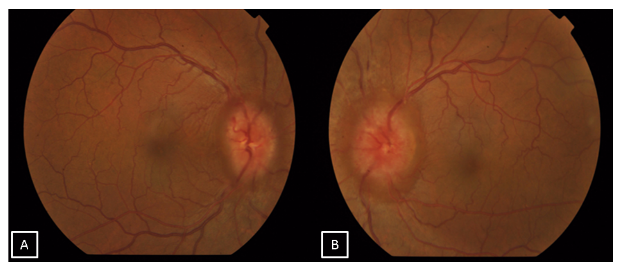
Figure 1: Fundus pictures of the right (A) and left eye (B) showing bilateral optic disc edema suggestive of papilledema