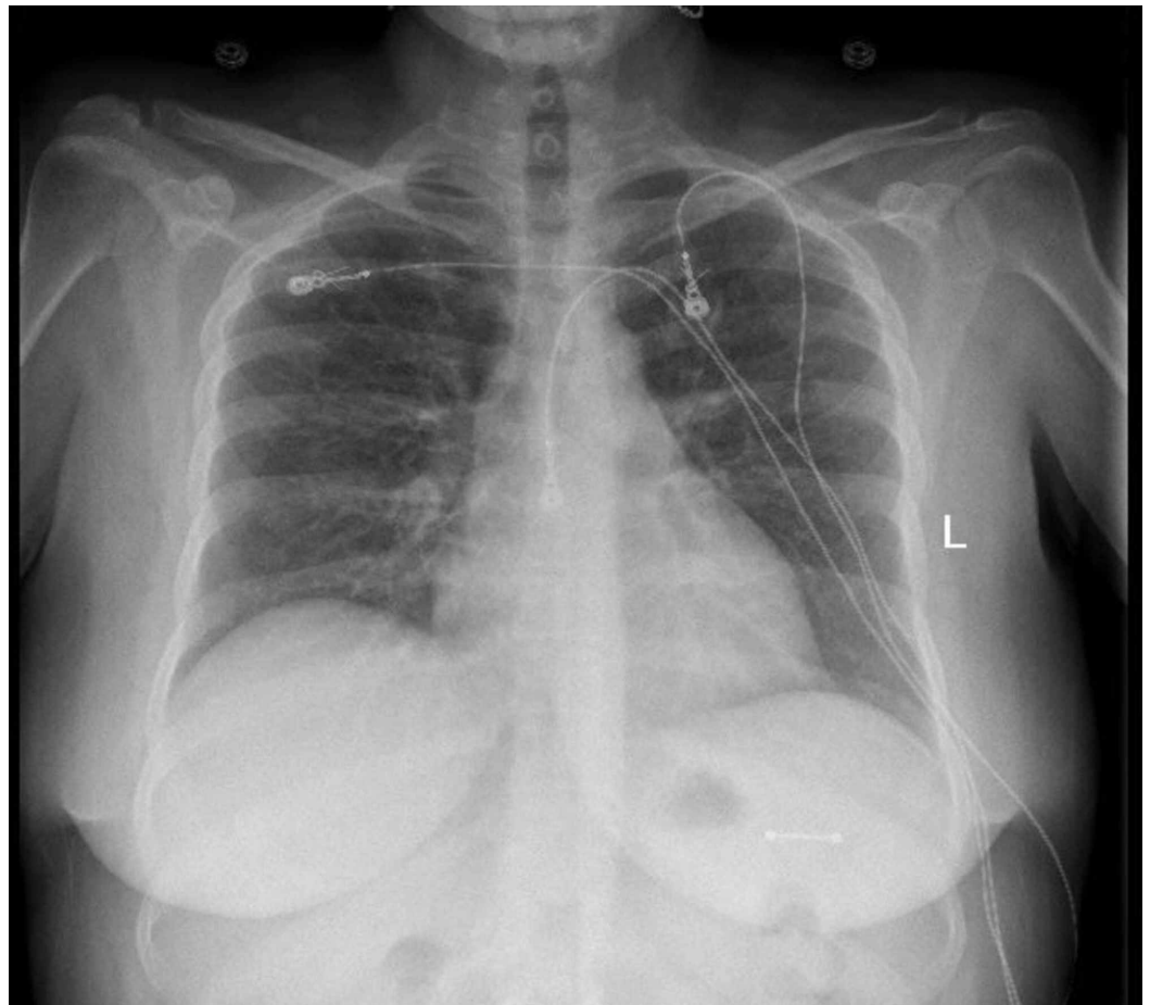
FIGURE 1: X-ray of the chest

The chest X-ray was normal (Figure 1). MRI brain did not reveal any underlying pathology (Figure 2). Due to increasing agitation, she was intubated for airway protection and started on Tamiflu for influenza. She was transferred to the intensive care unit for further management. On day two of follow-up, the patient was found to have hypotonic polyuria with a 24-urine output of 7L, urine osmolality of 316 mOsm/kg, with serum sodium of 151 mEq/L and serum osmolality of 327 mOsm/kg (Table 1). As her serum osmolality (327 mOsm/kg), and serum sodium (151 mEq/L) were above the threshold for maximal arginine vasopressin (AVP) secretion, a water deprivation test was not performed. Thus, we performed a desmopressin challenge test on day two. After desmopressin injection, her urine osmolality increased to 485 mOsm/kg, which was approximately 35% increase from baseline, less than 50% increase indicating partial nephrogenic diabetes insipidus (Table 2). As lithium could not be discontinued in the patient (she had difficulty controlling bipolar disorder per psychiatry), she was started on amiloride for lithium-induced partial nephrogenic diabetes insipidus. On day three of follow-up, she was extubated. Subsequently, her hypernatremia resolved in the next three days with amiloride therapy. Serum sodium normalized to 141 mmol/L and urine output decreased to 2340 ml/24 hours. She was subsequently discharged to a long term care facility.