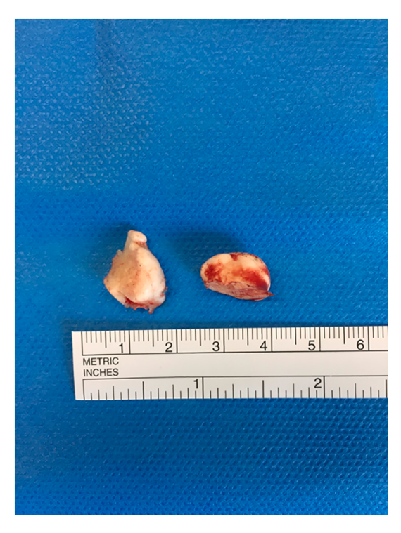
Fig. 3. Upper view and size of the mandibular tori.