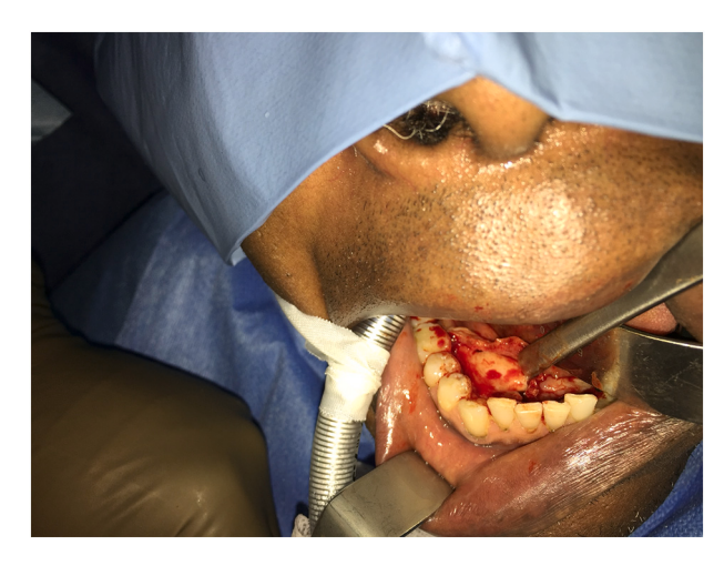
Fig. 2. Intraoperative view of the mandibular torus.

From a genetic point of view, the palatal torus may be hereditary, with autosomal dominant inheritance and a penetrance of 85% [5;8]. On the contrary, the mandibular torus appears to be less influenced by genetics. An allele on the X chromosome may be normal or predisposing