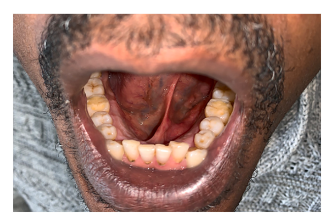
Fig. 4. Result at one year postoperatively.