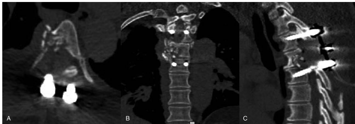
Figure 3. Postoperative CT images. Postoperative axial (A), coronal (B), and sagittal (C) CT imaging have been obtained with the bone window, showing fragments of bone from T5 and instrumented spinal stabilization on the 7th day after surgery.

Echinococcus granulosus must rely on two mammalian hosts to complete the life cycle. Dogs and wild carnivores, such as wolves, jackals, and foxes, are the definitive hosts. The intermediate hosts are sheep, cattle, pigs, and other cloven-hoofed animals, infecting larva by contacting canine animals or consuming water and food contaminated by eggs. [14] While humans are good intermediate hosts of Echinococcus granulosus , however, they are usually only victims and do not participate in the history of parasite life. Some ethnic minorities have the habit