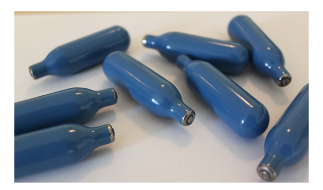
Figure 1 Pressurised whipped cream chargers, known as 'whippits', are a readily available source of nitrous oxide. They are often used to inflate balloons, from which the gas is inhaled.

Humphry Davy first described the anaesthetic properties of nitrous oxide in his book in 1800; already by