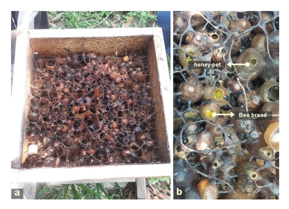
Figure 2. (a) Stingless bee colony and (b) honey and bee bread in separate cerumen pots.

If the bee pollen is not harvested, the worker bees pack the bee pollen inside a cerumen pot (for stingless bee) (Figure 2) or honeycomb cells (for honeybee) made from beeswax and resin. Once the pollen pots are full, the pots are sealed closed [37] before being consumed by larvae or young adult bees as a protein source [2]. During storage, lactic acid fermentation takes place to transform bee pollen into bee bread [38].