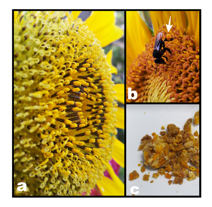
Figure 3. (a) Flower pollen, (b) bee pollen on the stingless bee ( Heterotrigona itama ) hind leg, and (c) fermented bee pollen (bee bread) collected from the stingless bee cerumen pot.

Flower pollen undergoes different development stages to become the end product known as bee bread. The biochemical profiles of flower pollen, bee pollen, and bee bread (Figure 3) are different as several biochemical changes take places at each stage [11,42]. Early studies revealed minor differences between bee bread and bee pollen. Bee bread lacks starch and has low ash content but has higher reducing sugar and fibre than bee pollen [43]. In the last decade, a few studies have attempted to compare the nutrient content of bee pollen and bee bread using more advanced technology. Although Anđelković et al. [42] found higher crude ash, protein, fewer minerals, and lower cellulose in bee bread than bee pollen, the botanical origins of the pollens which could influence the outcomes were not investigated.