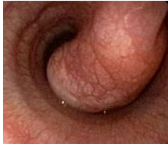
Fig. 2 Endoscopic view of the mass in the tracheal lumen. The surface of the mass was smooth and its colour was the same as that of the tracheal epithelium

The surgery was performed 9 days later. The dog was pre-medicated with morphine (Morphin; Takeda Austria GmbH) and acepromazine (Plegicil; Pharmaxim) and anaesthesia was induced with propofol (PropoVet Multidose, Fresenius Kabi AB), ketamine (Ketaminol; Intervet) and midazolam (Midazolam Accord; Accord Healthcare Limited). Anaesthesia was maintained with a constant-rate infusion of fentanyl (Fentanyl-Hameln; Hameln Pharma Plus GmbH). Intubation was performed under endoscopic guidance and an endotracheal tube was placed such that its cuff was distal to the mass. Cefazoline (Kefzol; Eurocept) was given intravenously 30 min before incision and every 90 min thereafter.