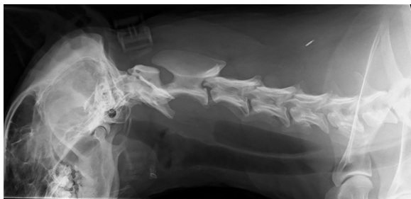
Fig. 1 Left lateral cervical radiograph revealed a crescent shaped soft tissue opaque mass of 14 mm \times 32 mm in the tracheal lumen at the level of the 5th and 6th vertebrae. The mass was at its widest in dorsal aspect of the trachea and extended to the opposite wall of the trachea

Tracheoscopy and bronchoscopy were performed under light anaesthesia with butorphanol (Torpuador, Richter Pharma AG) and propofol (PropoVet Multidose, Fresenius Kabi AB) with a 4.9-mm flexible endoscope (Olympus GIF-N180). An approximately 3 cm long intraluminal mass originating from the dorsal membrane of the trachea was detected approximately 11–12 cm from the larynx (Fig. 2). The base of the mass seemed to extend slightly to the left side of the dorsal membrane. FNA of the mass was performed using an endoscopic needle (Olympus NM-401L-0423, size 23G, diameter 0.6 mm and length 4 mm). Cytology of the samples revealed a scarce population of benign monomorphic mesenchymal cells. No signs of inflammation or malignancy were noted.