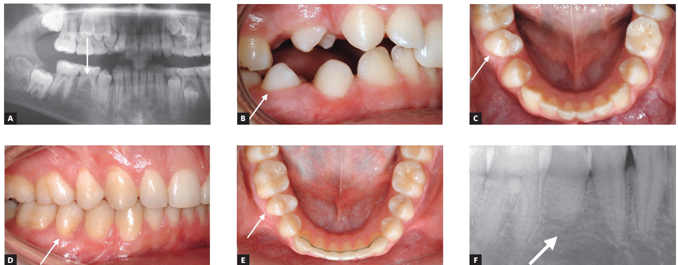
Figure 2 - Congenitally missing lower second premolar on the right side was seen during radiographic examination of an 11-year-old boy with Class II division 2 malocclusion and maxillary crowding (A). The roots of the primary second molar at the site of the missing premolar were short. The treatment plan included transplantation of the developing upper right second premolar (arrow) to the position of the congenitally missing mandibular premolar, followed by the fixed appliance treatment to close the extraction space and establish normal overjet and overbite. The transplanted premolar (arrow) erupted spontaneously in the oral cavity six months after transplantation from the subgingival position after surgery (B, C). The fixed appliances were bonded two years after transplantation and eruption of all permanent teeth. Normal tooth contacts were established after orthodontic treatment and overjet and overbite were corrected (D, E). Pulp obliteration and no hard tissue pathology were present at the transplanted premolar (F).