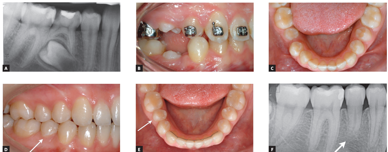
Figure 3 - The ectopic position of the developing mandibular right second premolar was present on the panoramic radiograph of a 12-year-old girl, who was seeking orthodontic treatment due to malposition of her maxillary teeth and Class II malocclusion (A). The premolar was severely distally tilted and the patient and her parents were interested to perform surgical uprighting (trans-alveolar transplantation) of the affected tooth instead of orthodontic extrusion to shorten the treatment time. The transplanted tooth erupted after few weeks into an oral cavity (B, C) and an orthodontic bracket was bonded after eruption into contacts with the opposing premolars. Normal occlusion was established after orthodontic treatment including the transplanted premolar (D, E; arrow). The root of the transplanted premolar continued development after surgery (arrow), but remained somehow shorter than normal (F). Pulp obliteration and normal hard periodontal tissues are also present on the radiograph.

Spot ankylosis is practically impossible to detect on radiographs, and the best way to confirm it is by applying orthodontic traction to the suspected transplant. If the transplant does not respond to orthodontic forces, while neighboring teeth are moving, then the ankylosis is confirmed.