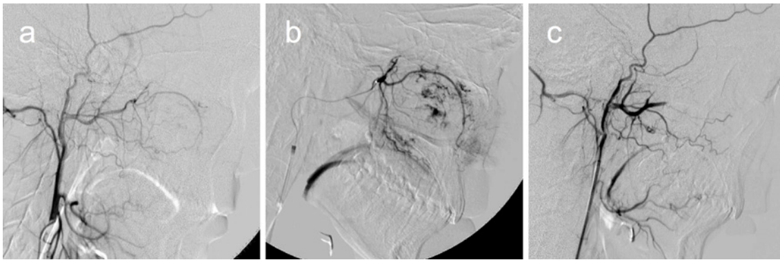
Figure 1. Angiography of Case 3

Angiography of the external carotid artery prior to embolization (a); selective angiography of the maxillary artery (pterygopalatine segment) (b); angiography of the external carotid artery after embolization (c)