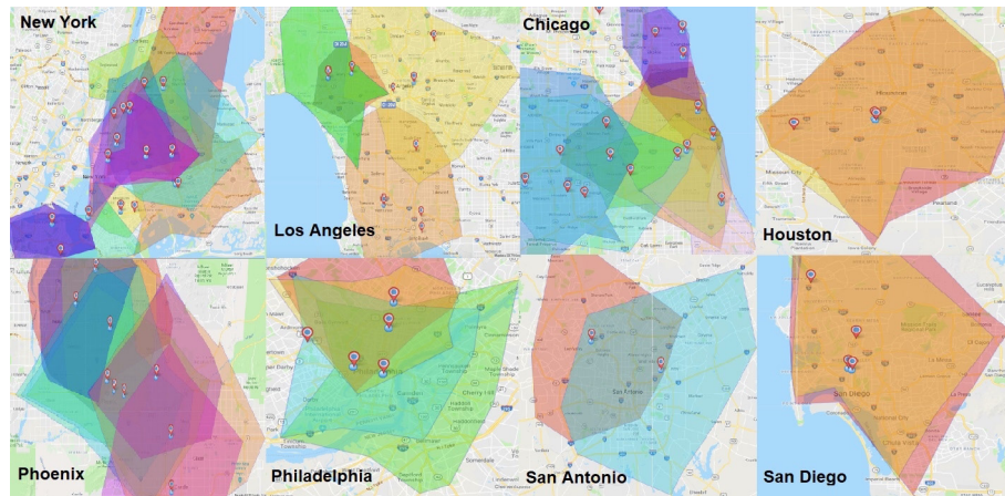
Figure 1 Urban trauma center density. Plots the level 1 and 2 trauma centers in 8 of the largest 15 cities in the USA. Colored polygons represent 20 min drive radius of the level 1 trauma centers. Online supplemental materials include all cities mapped.