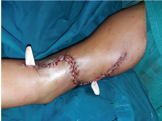
Fig. 3: Suture line post-residual tumor excision and brachial artery reconstruction.