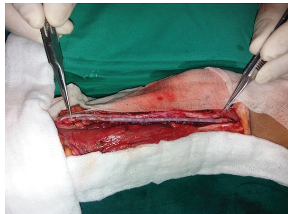
Fig. 2: The great saphenous vein graft (in-between the jeweler forceps).