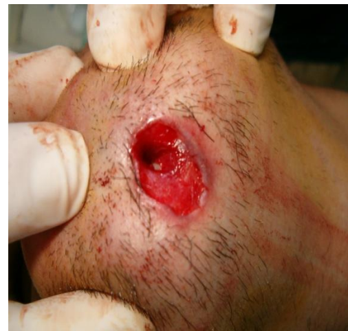
Figure 4: Curettage of the fistula

If correctly diagnosed and treated the tract is expected to disappear within 7 to 14 days. Systemic antibiotic therapy will result in a temporary reduction of the drainage and apparent healing [12]. This tract however will recur immediately the AB therapy is completed unless the initial source is not eliminated [12].