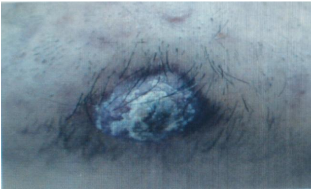
Figure 1: Skin lesion located on chin area

A 31-year-old male patient referred to our clinic with a chronically draining lesion on his chin. His history revealed that he had this lesion for more than 5 months and had undergone two times surgery and received antibiotics for prolonged period of time.