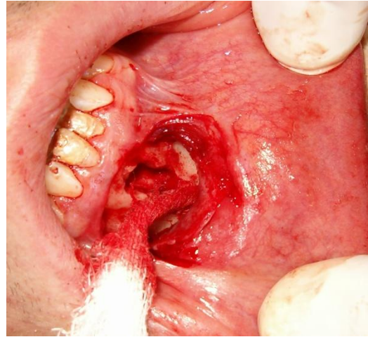
Figure 3: Surgical removal of periapical lesion with apical resection

initial filling of the root canal, an apicoectomy and sinus excision was performed. Three months postoperative control revealed no sinus fistula or exudates from chin or from the mucosa.