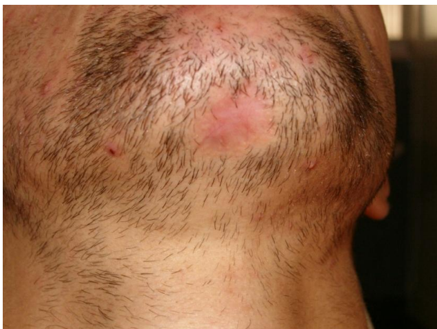
Figure 5: Total recovery in mental extraoral area a few weeks later

leaving a cutaneous scar [15]. The patients may have to undergo a revision of the scar.