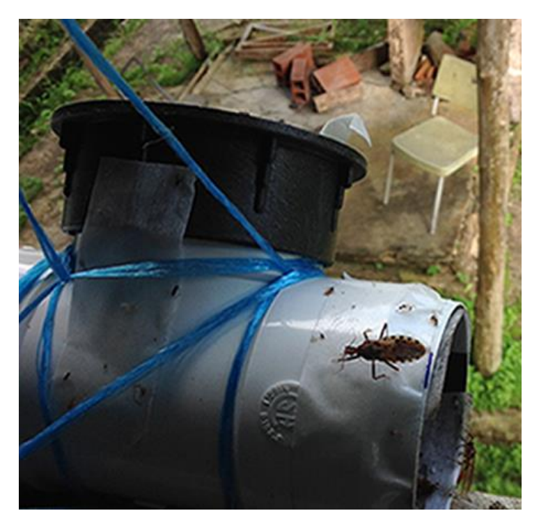
Figure 2. Successful mouse-baited trap. Adult P. geniculatus is caught on the adhesive material lining the outside of the trap. The trap is set on a windowsill, near an artificial light on the exterior of a ranger station in the village of Mt. Harris.