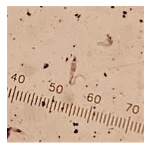
Figure 3. Giemsa stain of T. cruzi isolated from P. geniculatus collected in this study. Scale shown is in µm.

All protocols were performed under carefully controlled laboratory conditions. DNA extraction and blood meal analyses were carried out in separate laboratories to minimize cross-contamination risk. Bugs were processed in the Pathology and Parasitology Laboratory at the School of Veterinary Medicine of the University of the West Indies (UWI), St. Augustine, Trinidad. Triatomine species were determined using taxonomic keys and images from Lent and Wygodzinsky [30], Carcavallo et al. [31], and Patterson et al. [32]. T. cruzi infection in live bugs was diagnosed through direct microscopy observation (DMO) and staining of bug excrement and stomach contents (Figure 3), while T. cruzi infection in dead bugs was diagnosed using PCR. For DMO, 10 \mu L of Phosphate Buffer Solution (PBS) was mixed with 10 \mu L of excrement from each bug. A 5 \mu L aliquot of the solution was examined microscopically at 40× magnification. Trypanosomes were identified by their movement and morphology. Bugs were stored in 70% ethanol (EtOH) for approximately one to three days, until molecular analysis was carried out.