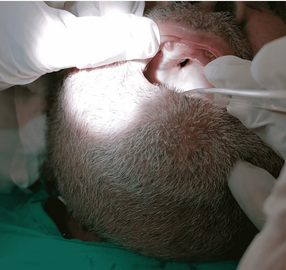
FIGURE 1: Necrotic part of the hard palate.

cavity during the weekly control after hospitalization. He is alive three months after the discharge.