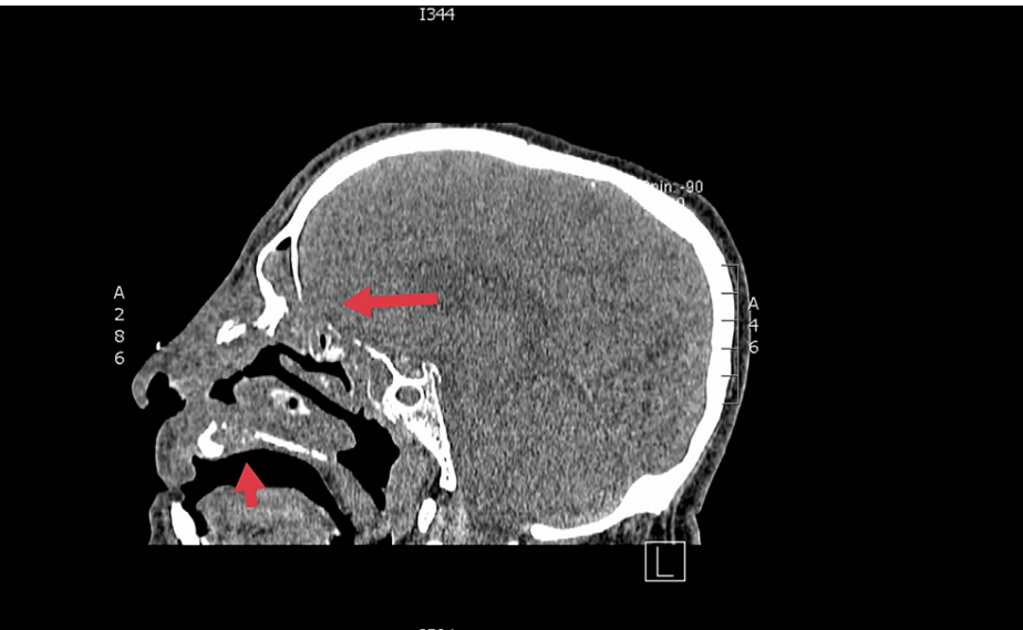
FIGURE 2: Sagittal plane: Cranial computed tomography scan.

Arrows indicate the osteolytic regions of the hard palate and posterior table of the frontal sinus.