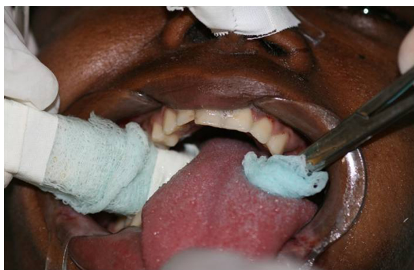
Figure 6. Clinical aspect after dental behaviors performed – Significant improvement of oral health of patients admitted to the ICU.

Dental care in patients with chronic renal insufficiency must be performed in the days they do not undergo dialysis, in order to avoid bleeding. Therefore, the use of heparin (anticoagulant) in these clinical activities is suggested. It is important to emphasize that, specifically in this case, the dental procedure was not performed because, according to the doctor, it was not necessary in the ICU [13–15].