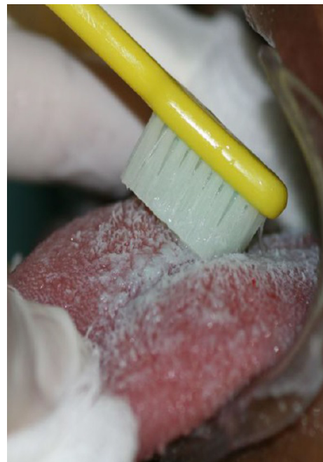
Figure 5. Removing tongue coating with toothbrush – posterior direction to previous.