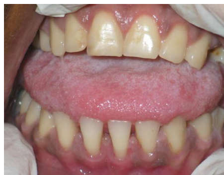
Figure 7. Clinical aspect after three days of activities directed to the oral health of the patient admitted to the ICU – Adequacy of the oral cavity and patient satisfaction – Elimination of inflammation, dental calculus, and tongue coating.

The use of chlorhexidine 0.12% is the standard protocol of oral hygiene used in ICUs [2–4,6,8] to reduce the biofilm and respiratory diseases associated with mechanical ventilation. It is a microbial agent of broad-spectrum activity against gram-negative bacteria and has no