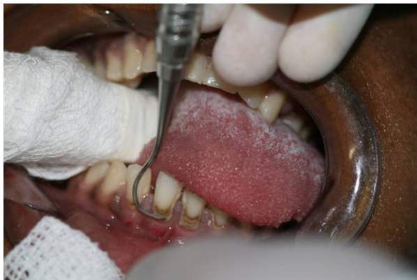
Figure 3. Supragingival scraping to remove calculus on anterior teeth in the ICU – Clinical conduct carried out by qualified dentist.