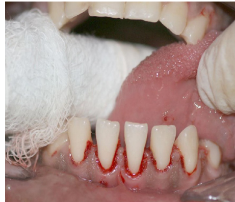
Figure 4. Clinical aspect after periodontal activity in ICU.