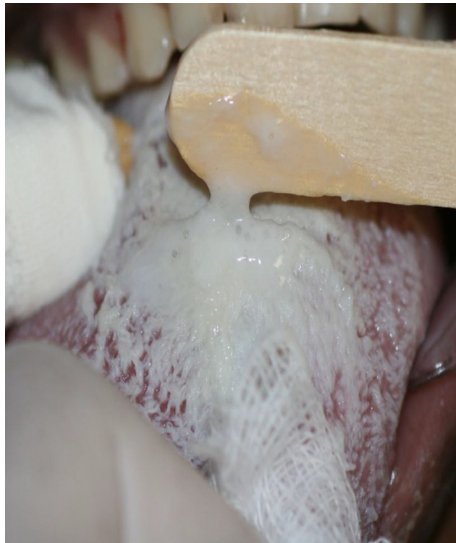
Figure 2. High concentration of tongue coating – oral hygiene deficiency in the intensive care unit (ICU).

Guidance on the proper use of chlorhexidine 0.12% of 12–12 h, with the use of needle holder, gauze soaked in