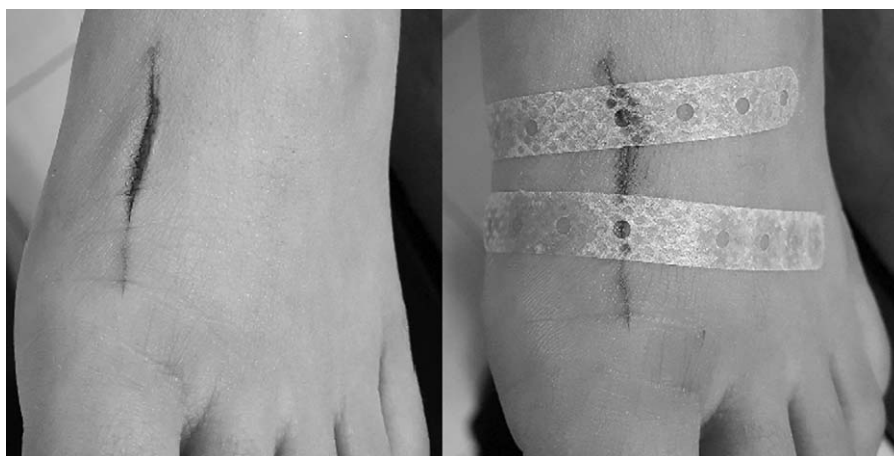
Figure 1. Leukosan SkinLink. The tissue adhesive was applied on the strips rather than directly on the wound.