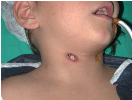
FIGURE 2: Foreign body in the right side of the neck before removal.

shape, was made from hard plastic, and was 13 mm in length. The cavity was filled with granulation tissue. The examination did not reveal any pus or presence of a fistula tract with deeper tissues. Primary suturation was applied to the wound. Postoperatively, the patient recovered very well without any complications.