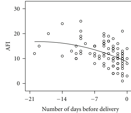
FIGURE 4: Relationship between amniotic fluid index (AFI) and time of onset of spontaneous labor ( n = 87 cases). Only the last measurement from an individual case was used if more than one measurement was available.