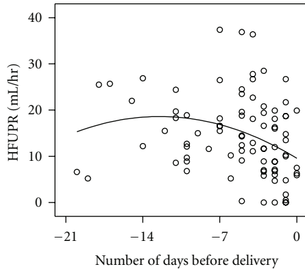
FIGURE 2: Relationship between hourly fetal urine production rate (HFUPR) and time of onset of spontaneous labor ( n = 89 cases). Only the last measurement from an individual case was used if more than one measurement was available.

* P < 0.02 ; ** P < 0.05 compared with the other 3-day categories (1-way ANOVA with Bonferroni correction).