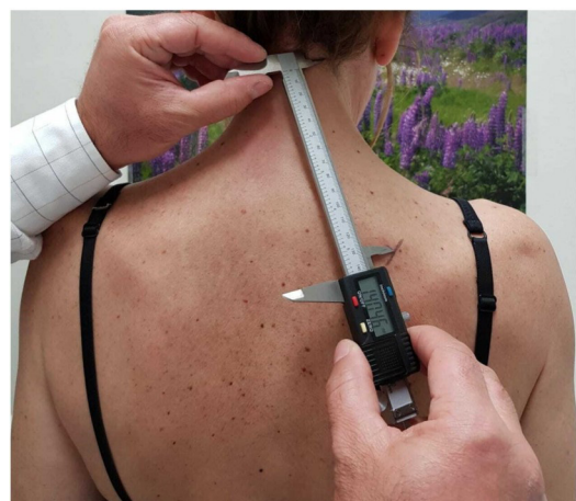
Figure 3 Levator scapulae length measurement.

The SPADI was assessed in all participants. The SPADI is composed of 13 questions and contains two domains: pain and disability. The score of the questionnaire ranges from 0 to 100, with very high scores indicating worse function. The numeric pain scale runs from 0 to 10, with 0 indicating no pain and 10 representing the worst pain. 30 The SPADI has shown a good internal consistency with a Cronbach's alpha of 0.95 for the total score, 0.92 for the pain subscale and 0.93 for the disability subscale as